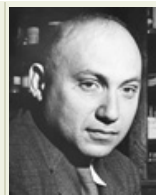
Physiology or Medicine