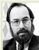
David Baltimore 1975 Physiology or Medicine