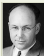
Wendell M. Stanley 1946 Chemistry