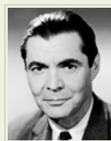
George E. Palade 1974 Physiology or Medicine