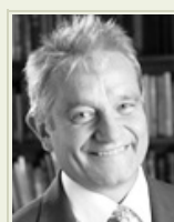
Paul Nurse 2001 Physiology or Medicine