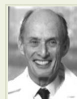
Paul Greengard 2000 Physiology or Medicine