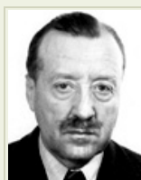
John H. Northrop 1946 Chemistry