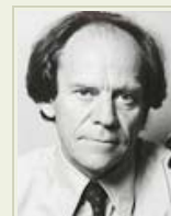
Torsten N. Wiesel 1981 Physiology or Medicine