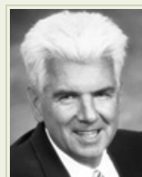
Günter Blobel 1999 Physiology or Medicine