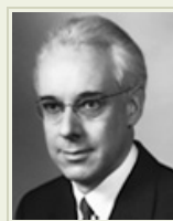
Stanford Moore 1972 Chemistry