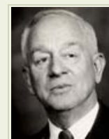
Peyton Rous 1966 Physiology or Medicine