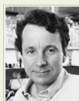
Roderick MacKinnon 2003 Chemistry

Since the institution's founding in 1901, 23 Nobel Prize winners have been associated with the university. Of these, two are Rockefeller graduates (Edelman and Baltimore) and six laureates are current members of the Rockefeller faculty (Günter Blobel, Christian de Duve, Paul Greengard, Roderick MacKinnon, Paul Nurse and Torsten Wiesel).