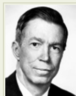
R. Bruce Merrifield 1984 Chemistry