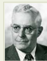
William H. Stein 1972 Chemistry