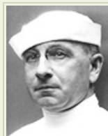
Alexis Carrel 1912 Physiology or Medicine