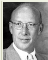
Physiology or Medicine