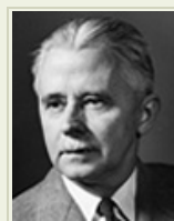
H. Keffer Hartline 1967 Physiology or Medicine