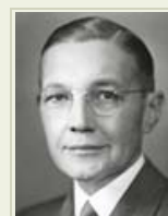
Herbert S. Gasser 1944 Physiology or Medicine