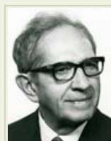
Albert Claude 1974 Physiology or Medicine