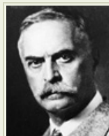
Karl Landsteiner 1930 Physiology or Medicine