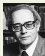
Gerald M. Edelman 1972 Physiology or Medicine