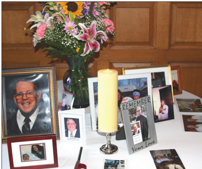
Family and friends were encouraged to bring pictures of loved ones to display at the ceremony.

On Thursday, September 11, more than 90 friends, family and caregivers joined together at the Robert Treat Paine Estate in Waltham to remember patients and loved ones who died in the last year. Many Hospice staff and volunteers participated in the